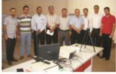
Erbil - Iraq Antenna Trainer