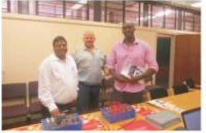
South Africa University of Johannesburg