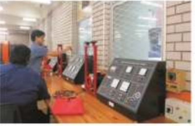
South Africa Three Phase Induction Motor