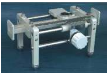
Order Code - 10539 Slotted Section

Slotted section is used to measure various measuring parameter in microwave. for example to determine VSWR, phase and impedances. These consists of a slot in center of waveguide in which we can connect a probe and probe can be moved in slot and position of probe can be measured by its Vernier scale. The travel of probe carriage is more than three times of half wavelength.