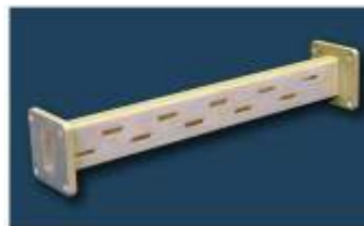
Order Code - 10537 Slotted Broad Wall Antenna