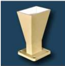
Order Code - 10531 Pick-up Horn Antenna