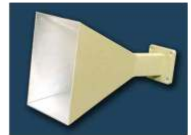
Order Code - 10541 Standard Gain Horn Antenna