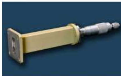
Order Code - 10540 Solid Dielectric Cell

These are used to measure dielectric constant of any solid material these consists of a cavity for keeping the sample and micrometer to read the position of sample.