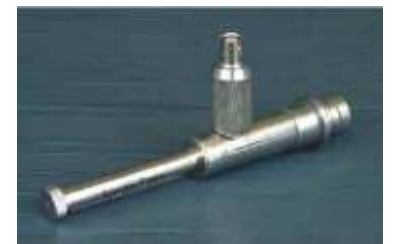
Order Code - 10543 Tunable Probe

Tunable probes are very useful devices to measure the SWR and Impedances. Tunable probe is consists of a crystal detector and a small wire antenna in coaxial housing. Its depth of penetration into the slotted section is variable.