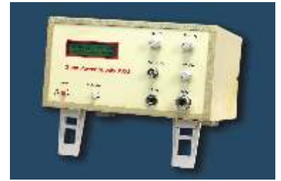
Order Code - 10503 Gunn Power Supply