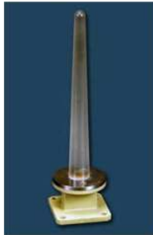
Order Code - 10508 Dielectric Antenna