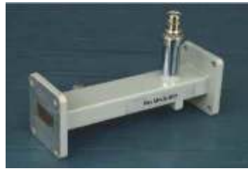
Order Code - 10532 Pin Modulator

Note: Specifications are subject to change.