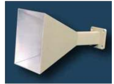
Order Code - 10534 Pyramidal Horn