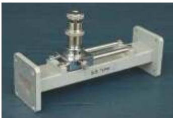
Order Code - 10536 Slide Screw Tuners

Slide Screw Tuner is a very useful component in a microwave laboratory. It is mainly used for Impedance measurement. Its tuner can be adjusted for low and high impedance position.