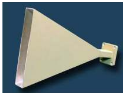
Order Code - 10510 E-Plane Sectoral Horn Antenna