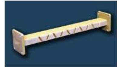
Order Code - 10538 Slotted Narrow Wall Antenna