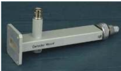
Order Code - 10507 Detector Mount

The crystal detector can be used for the detection of microwave signal. At low level of microwave power, the response of each detector approximates to square law characteristics and may be used with a high gain selective amplifier having a square law meter calibration.