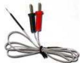
K-Type Thermocouple Lead (With 16968 Only)

Note: Specifications are subject to change.