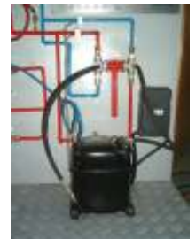
Reverse Heat Valve