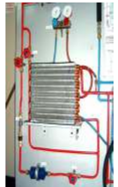
Flow Meter & Charging Gauges

Note: Specifications are subject to change.