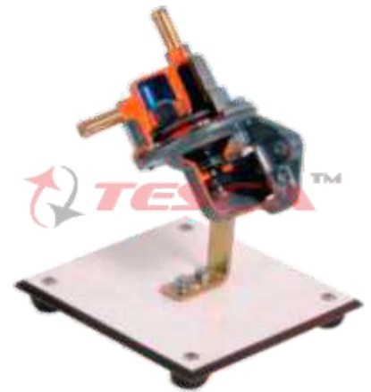
Order Code - 32531 Synchromesh Gear Box – 4 Forward & 1Reverse