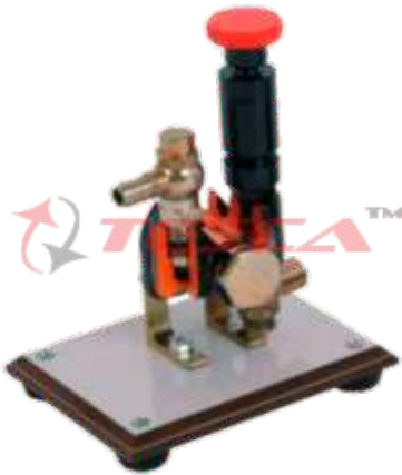
Order Code - 32529 Sectioned Car Electric Horn Relay Petrol