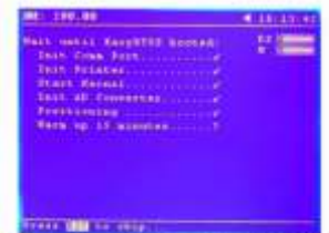
Display (Graphic LCD 320 x 240 Dots)