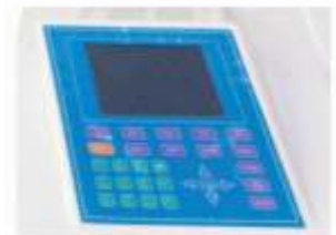
Soft touch keypad