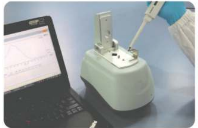
Order Code - 58014

The variable path length of Nano Ready realizes both the minimum sample volume detection as low as 0.5pL, suitable for precious samples, and the detection to the high concentration samples without dilution at all. Including the liquid drop, it builds in the standard cuvette detection module for more use.