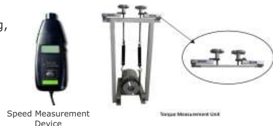
Speed Measurement Device