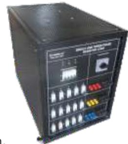
Single and Three Phase Resistive Load