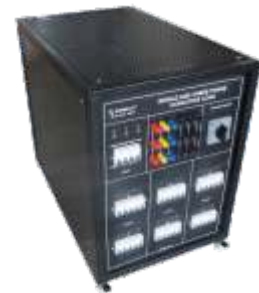
Single and Three Phase Capacitive Load