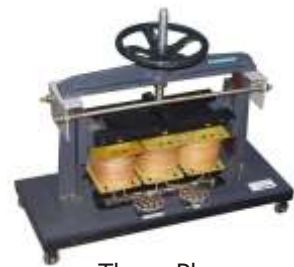
Three Phase Inductive Load