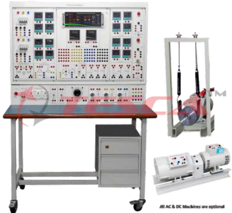
All AC & DC Machines are optional

Workstation comprises of separate AC and DC measuring sections equipped with all the necessary instruments such as digital meters, facility to connect AC and DC Supplies along with protection devices such as Fuses, MCB's, Supply Indicators, etc. There are multiple buses provided on the Workstation to make external connections while performing AC and DC Machines Experiments.