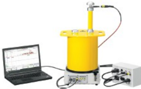
Figure: PD-TaD 62 with laptop and Power Box