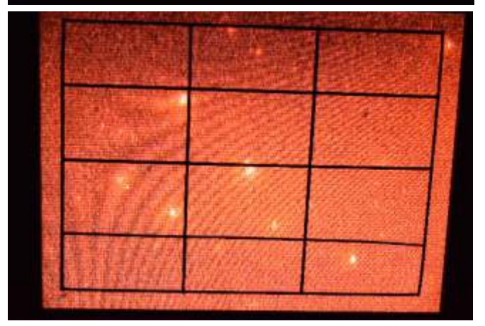
The result of this unit are within 5% of the standard value.

The experiment is complete in all respect.